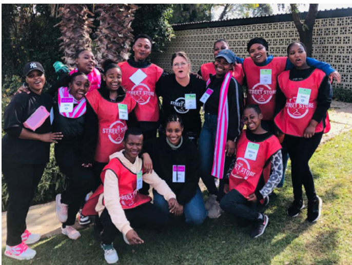
Street Store project