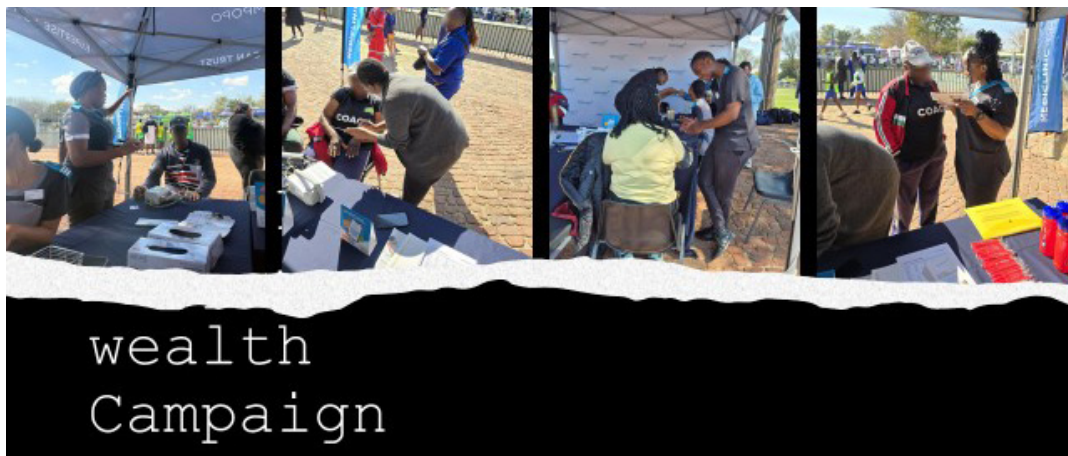
Community health screening

At Mediclinic Higher Education, we take great pride in our commitment to giving back to the community through meaningful initiatives. Each academic year, students across our six learning centres develop and submit community project proposals. Once approved, these projects are brought to life through dedicated implementation by the students. At the conclusion of the year, students reflect on their experiences, sharing insights into the value and impact of their projects both personally and within the community. Students at the Limpopo Learning Centre hosted a community health screening campaign in Polokwane, offering free blood pressure, cholesterol, body mass index (BMI) and blood glucose testing. They also participated in and supported the Mandela Day Soup Kitchen Drive, reaching out to unemployed and homeless individuals in the dusty streets of Polokwane. The team successfully served warm vegetable soup, bread and fruit to approximately 100 people, bringing comfort and nourishment to those in need.