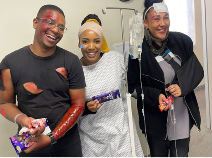
Injury on duty