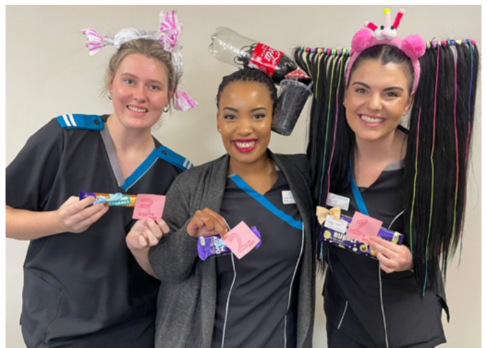
Funky hair day

At the Mediclinic Learning Centre Central Region, the students used specific themes for each day of their team-building event to showcase their creative ideas, celebrating everyone's participation. While all were winners, each day's standout team was rewarded with a small prize, fostering healthy competition and camaraderie.